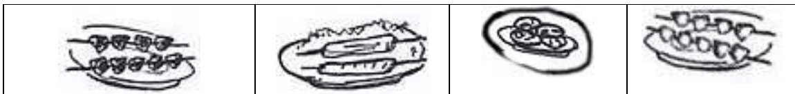
Lahim micwe Grilled meat (in the US, 'Sheesh Kobab' is used. There is no 'Sheesh Kobab' in Lebanese)