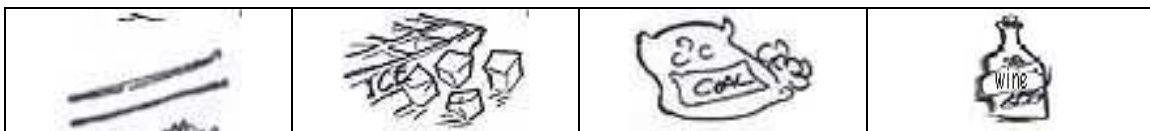
Cyec Sticks Ciic (single)